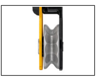
The faceted sheave only rotates in one direction, providing excellent efficiency when hauling and adding friction zones for the rope for additional braking when lowering.