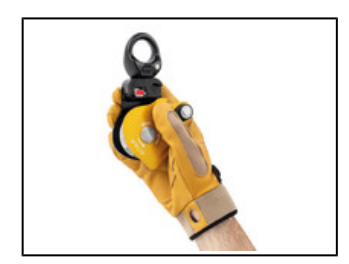
Triple-action opening of the moving side plate is quick and easy, even with gloves.

Openable even when attached to the anchor, the SPIN L1D pulley is designed to be used in conjunction with a descender for maximum simplicity in setting up a deviation for a heavy load. The faceted sheave only rotates in one direction, providing excellent efficiency when hauling and adding friction zones for the rope for additional braking when lowering. The swivel facilitates handling, allowing the pulley to be oriented under load, and direct connection of carabiners, ropes or slings.