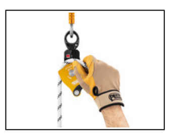
The rope can be installed with the device connected to the anchor.